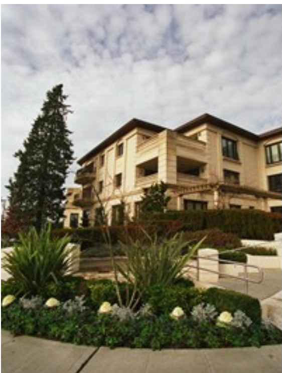
ColdStream Corporate Office Bellevue, Washington